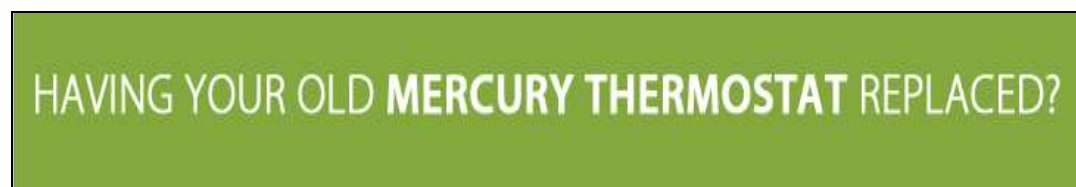
Exhibit 5: Web Consumer advertisement (fixed image- first of three)

Google AdWords — In 2011, TRC developed and deployed a Social Media strategy that leveraged the power of Google and the popularity of Facebook. This campaign, which ran from mid-September through early December, geo-targeted contractors and consumers in states with mercury thermostat disposal bans, including Illinois, in an effort to create awareness and increase thermostat collections.