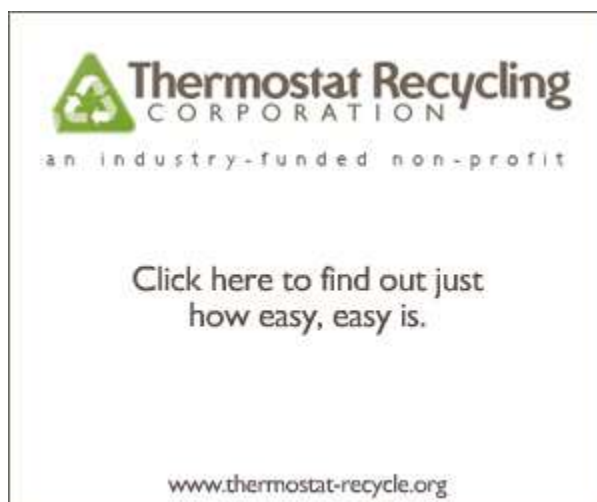
Exhibit 6: Web Banner Advertisement (300x250 fixed image version)

Ads and landing pages were developed with variable messages targeting both audiences. What made this campaign unique is the fact that it was targeted. Advertisements appeared on Google search results pages after an individual searched terms related to TRC's mission (E.g. thermostat replacement, contracting recycling regulations, mercury thermostat recycling, programmable