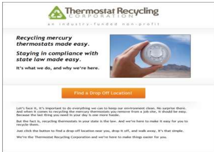
Exhibit 7: Google "Landing Page:

Print Advertisement HVACR Business Magazine — TRC placed a ½ page color advertisement in a special section on thermostats in the April addition.