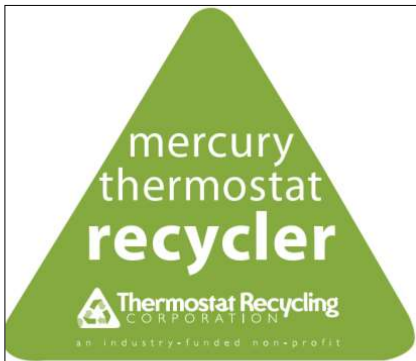
Exhibit 2: Example of New Print Collateral—Vehicle Cling Sticker

In partnership with the Heating, Air-Conditioning & Refrigeration Distributors International (HARDI), TRC re-launched the Mercury Thermostat Recycling Awards in May 2012 . The award(s) are intended to incent participation in the program by recognizing the distributor(s) that recovered the most mercury thermostats and/or developed innovative strategies to promote the program at their branch location(s).