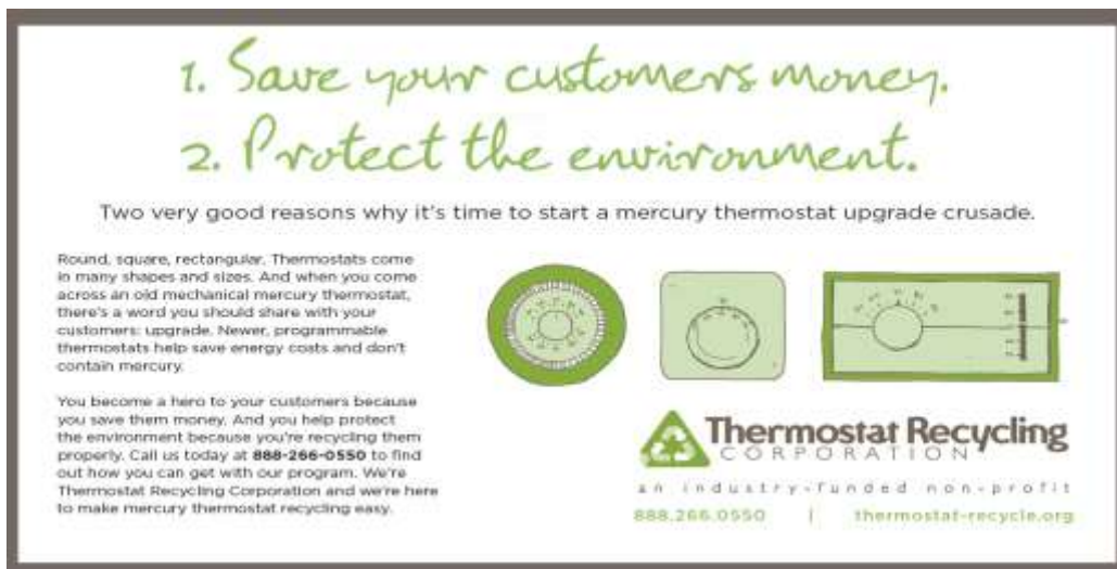
Exhibit 8: Advertisement Copy HVACR Business Magazine

Tradeshows —TRC attended and exhibited at the following trade shows relevant to Illinois: